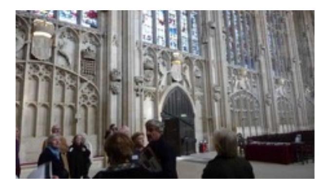
Kings College Chapel

King's College, the Wren Library of Trinity College, James Gibbs's Senate House and the Old Schools and University Combination Room.