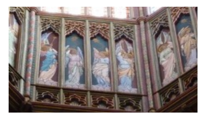
Pre-Raphaelite art on Ely Cathedral's Lantern

Other visits were made including St John's College and its Combination Room, and dinners were taken at Clare College and Queens' College. A day visit to the City of Ely focused on the Cathedral and associated buildings.