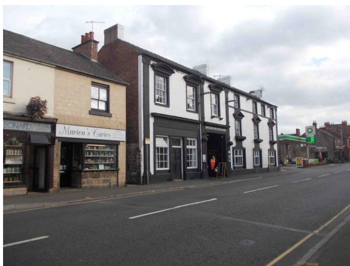
Belper High Street

From Masson, the party went to Belper, another textile centre, where, after lunch, they toured the town, seeing excellent surviving examples of workers' housing and the fine mills. Since then the small town of Belper has won a Great British High Street of the Year Award from the government ministry, Department of Communities and Local Government and is overall "High Street Champion".