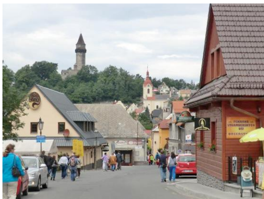
Štramberk, Moravian-Silesian Region

At the small town of Štramberk there was a meeting with the mayor and Czech businessmen active in restoring monuments of the region.