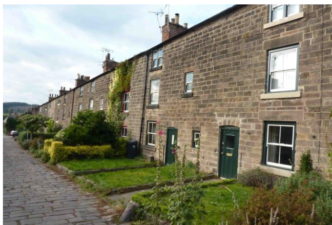
Belper workers' houses